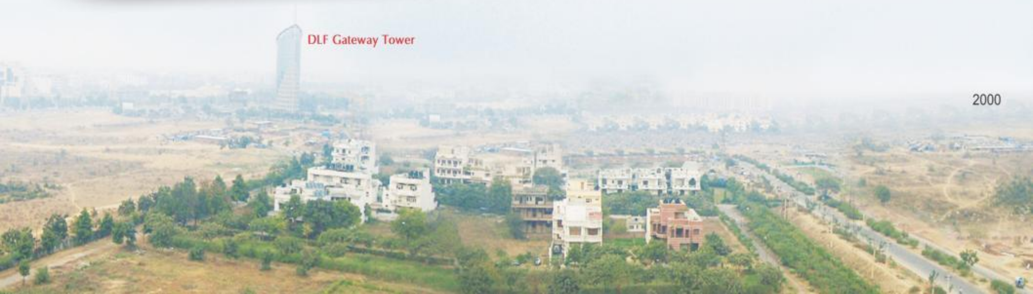
DLF Gateway Tower