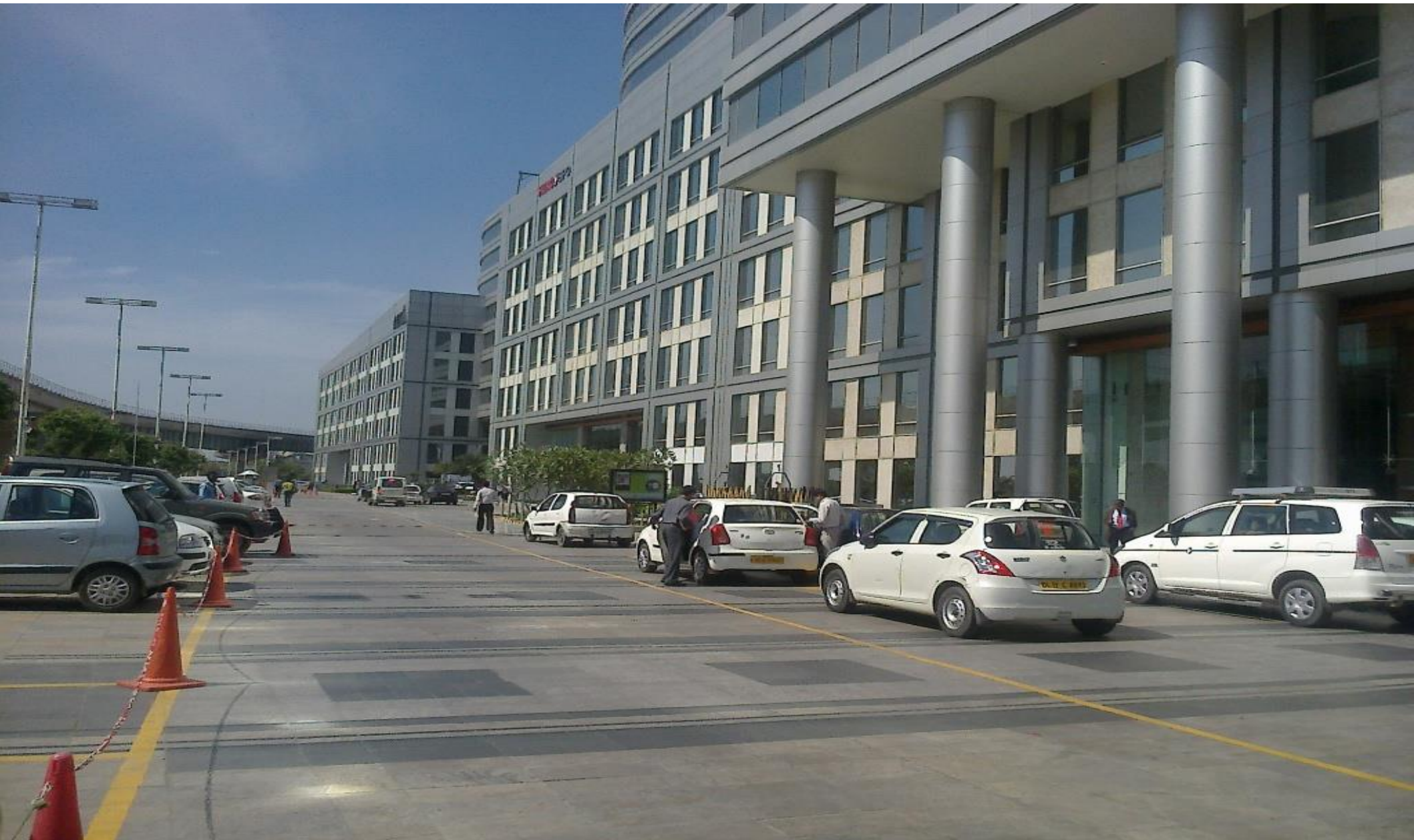
Tower A, B, C – Front View